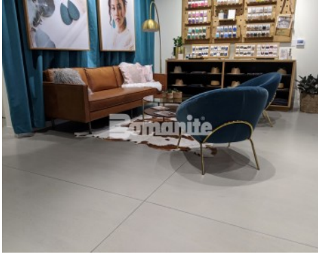
Nickel & Suede Retail Shop - Bomanite Custom Polishing System Modena SL Interior Flooring