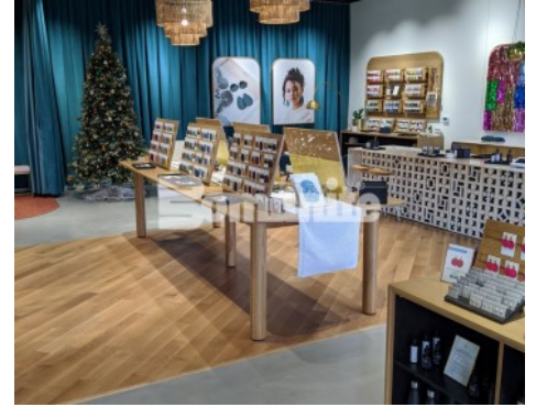
Nickel & Suede Retail Shop - Bomanite Custom Polishing System Modena SL Interior Flooring