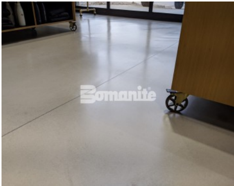
Nickel & Suede Retail Shop - Bomanite Custom Polishing System Modena SL Interior Flooring