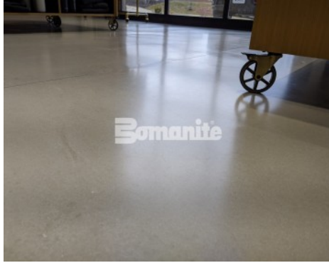
Nickel & Suede Retail Shop - Bomanite Custom Polishing System Modena SL Interior Flooring