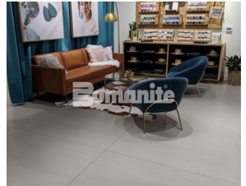
Nickel & Suede Retail Shop - Bomanite Custom Polishing System Modena SL Interior Flooring