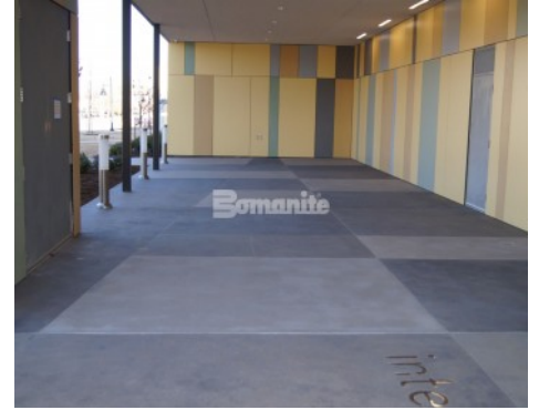
Tulsa County Family Center for Juvenile Justice - Bomanite Sandstone Texture Exposed Aggregate with Bomanite Con-Color