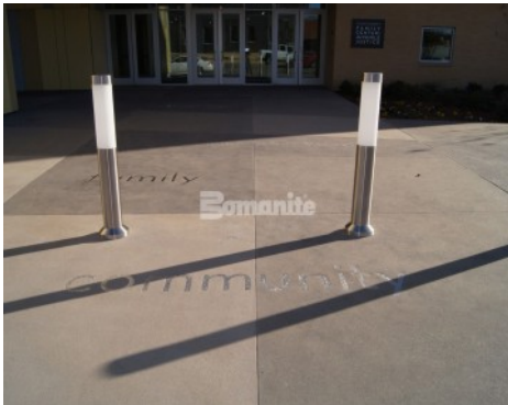
Tulsa County Family Center for Juvenile Justice - Bomanite Sandstone Texture Exposed Aggregate with Bomanite Con-Color