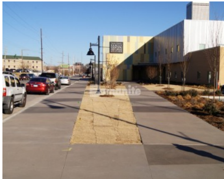
Tulsa County Family Center for Juvenile Justice - Bomanite Sandstone Texture Exposed Aggregate with Bomanite Con-Color