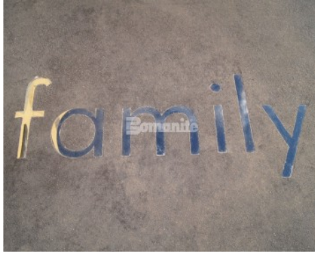
Tulsa County Family Center for Juvenile Justice - Bomanite Sandstone Texture Exposed Aggregate with Bomanite Con-Color