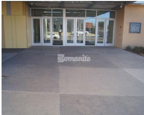
Tulsa County Family Center for Juvenile Justice - Bomanite Sandstone Texture Exposed Aggregate with Bomanite Con-Color