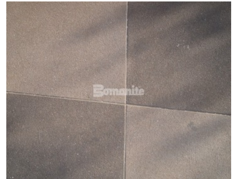
Tulsa County Family Center for Juvenile Justice - Bomanite Sandstone Texture Exposed Aggregate with Bomanite Con-Color