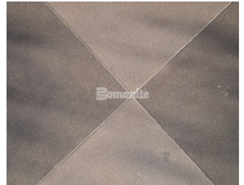
Tulsa County Family Center for Juvenile Justice - Bomanite Sandstone Texture Exposed Aggregate with Bomanite Con-Color