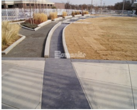
Owasso Redbud Festival Park - Bomanite Imprinted Chipped Shale Riverbed Pattern and Bomacron Sandstone Texture Accent Bands