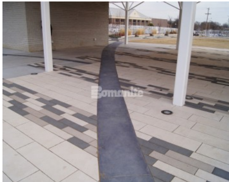
Owasso Redbud Festival Park - Bomanite Imprinted Chipped Shale Riverbed Pattern and Bomacron Sandstone Texture Accent Bands