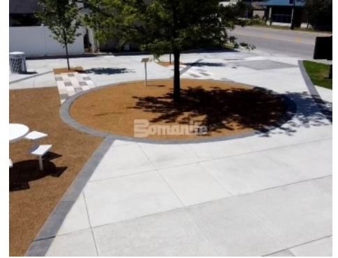
Owasso Redbud Festival Park - Bomanite Imprinted Chipped Shale Riverbed Pattern and Bomacron Sandstone Texture Accent Bands