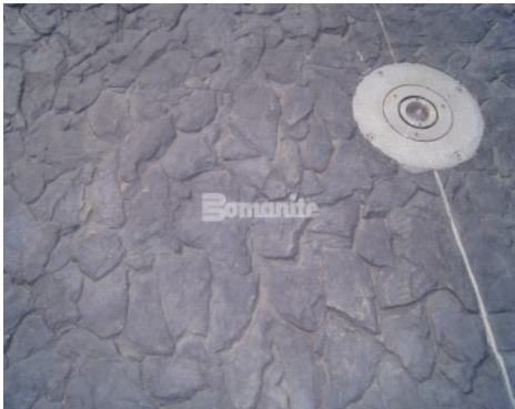
Owasso Redbud Festival Park - Bomanite Imprinted Chipped Shale Riverbed Pattern and Bomacron Sandstone Texture Accent Bands