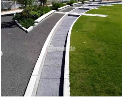
Owasso Redbud Festival Park - Bomanite Imprinted Chipped Shale Riverbed Pattern and Bomacron Sandstone Texture Accent Bands