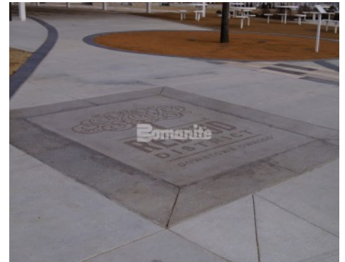
Owasso Redbud Festival Park - Bomanite Imprinted Chipped Shale Riverbed Pattern and Bomacron Sandstone Texture Accent Bands