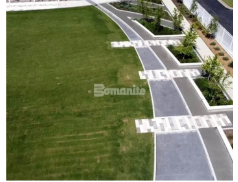
Owasso Redbud Festival Park - Bomanite Imprinted Chipped Shale Riverbed Pattern and Bomacron Sandstone Texture Accent Bands