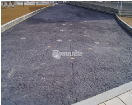
Owasso Redbud Festival Park - Bomanite Imprinted Chipped Shale Riverbed Pattern and Bomacron Sandstone Texture Accent Bands