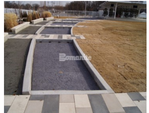
Owasso Redbud Festival Park - Bomanite Imprinted Chipped Shale Riverbed Pattern and Bomacron Sandstone Texture Accent Bands