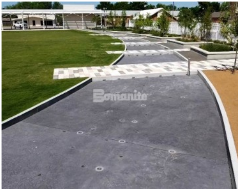
Owasso Redbud Festival Park - Bomanite Imprinted Chipped Shale Riverbed Pattern and Bomacron Sandstone Texture Accent Bands