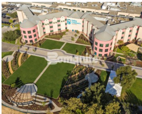
Valley Children's Hospital Landscape Master Plan Phase 2 - Bomanite Revealed and Bomanite Sandstone Texture Exposed Aggregate