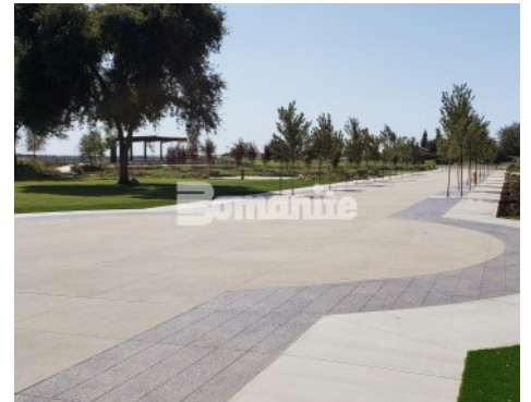
Valley Children's Hospital Landscape Master Plan Phase 2 - Bomanite Revealed and Bomanite Sandscape Texture Exposed Aggregate