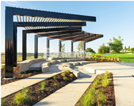
Valley Children's Hospital Landscape Master Plan Phase 2 - Bomanite Revealed and Bomanite Sandscape Texture Exposed Aggregate