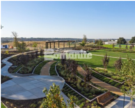
Valley Children's Hospital Landscape Master Plan Phase 2 - Bomanite Revealed and Bomanite Sandstone Texture Exposed Aggregate