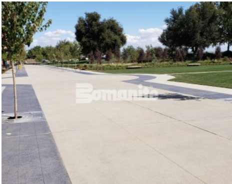
Valley Children's Hospital Landscape Master Plan Phase 2 - Bomanite Revealed and Bomanite Sandscape Texture Exposed Aggregate