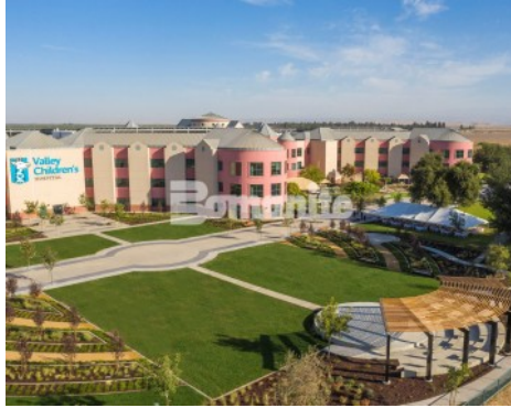
Valley Children's Hospital Landscape Master Plan Phase 2 - Bomanite Revealed and Bomanite Sandscape Texture Exposed Aggregate