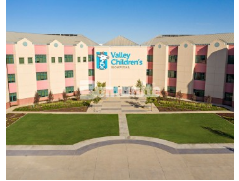
Valley Children's Hospital Landscape Master Plan Phase 2 - Bomanite Revealed and Bomanite Sandscape Texture Exposed Aggregate