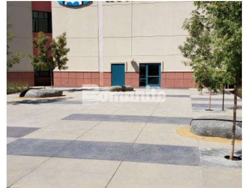
Valley Children's Hospital Landscape Master Plan Phase 2 - Bomanite Revealed and Bomanite Sandstone Texture Exposed Aggregate