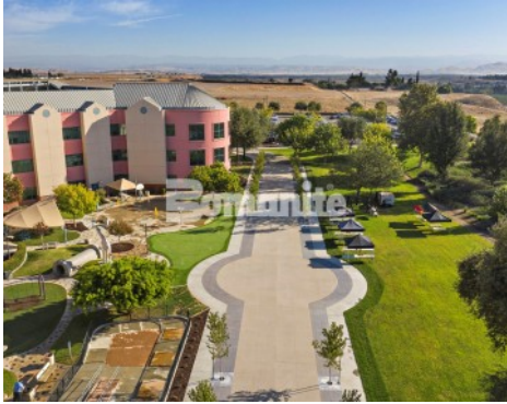
Valley Children's Hospital Landscape Master Plan Phase 2 - Bomanite Revealed and Bomanite Sandscape Texture Exposed Aggregate