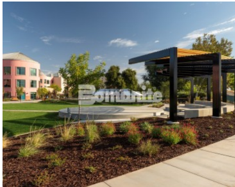
Valley Children's Hospital Landscape Master Plan Phase 2 - Bomanite Revealed and Bomanite Sandscape Texture Exposed Aggregate