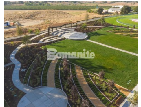
Valley Children's Hospital Landscape Master Plan Phase 2 - Bomanite Revealed and Bomanite Sandscape Texture Exposed Aggregate