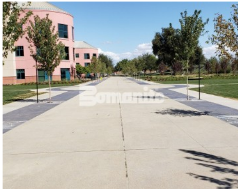
Valley Children's Hospital Landscape Master Plan Phase 2 - Bomanite Revealed and Bomanite Sandscape Texture Exposed Aggregate