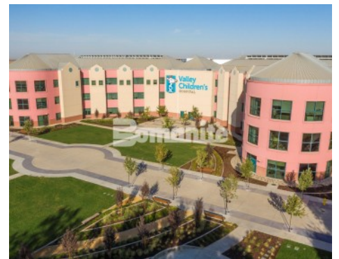
Valley Children's Hospital Landscape Master Plan Phase 2 - Bomanite Revealed and Bomanite Sandstone Texture Exposed Aggregate