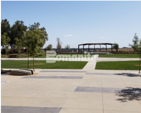
Valley Children's Hospital Landscape Master Plan Phase 2 - Bomanite Revealed and Bomanite Sandstone Texture Exposed Aggregate