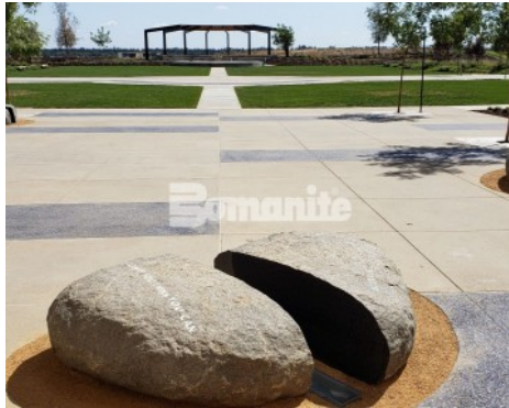
Valley Children's Hospital Landscape Master Plan Phase 2 - Bomanite Revealed and Bomanite Sandstone Texture Exposed Aggregate