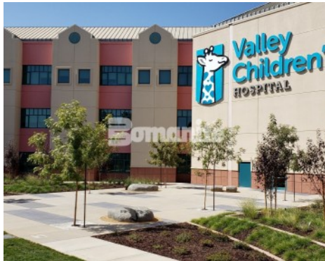
Valley Children's Hospital Landscape Master Plan Phase 2 - Bomanite Revealed and Bomanite Sandstone Texture Exposed Aggregate