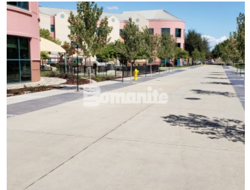
Valley Children's Hospital Landscape Master Plan Phase 2 - Bomanite Revealed and Bomanite Sandstone Texture Exposed Aggregate