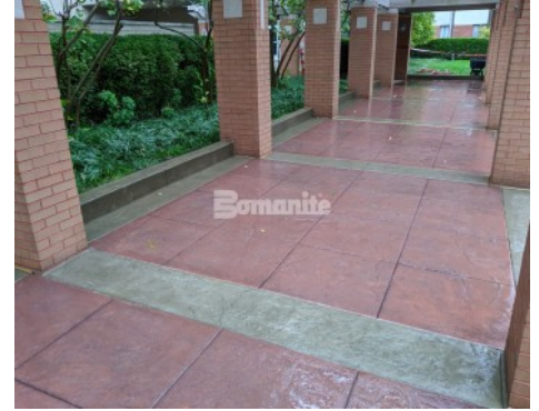
Residence Condominiums - Bomanite Imprinted Concrete System Bomacron Slate Texture with Hand Tool Joints Sidewalk