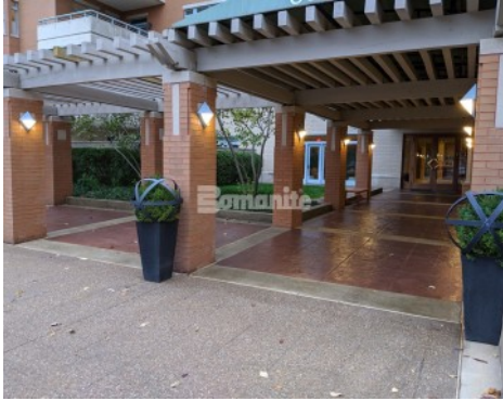
Residence Condominiums - Bomanite Imprinted Concrete System with Bomanite Exposed Aggregate Sandstone Texture Finish Driveway; Bomacron Slate Texture with Hand Tool Joints Sidewalk