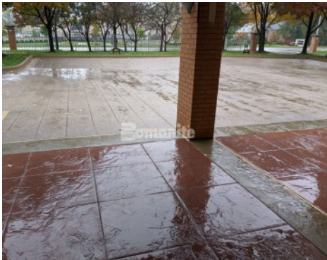
Residence Condominiums - Bomanite Imprinted Concrete System with Bomanite Exposed Aggregate Sandstone Texture Finish Driveway; Bomacron Slate Texture with Hand Tool Joints Sidewalk