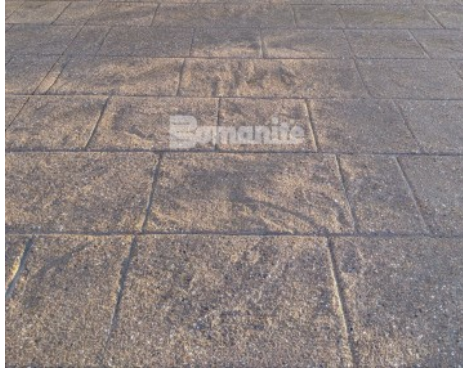
Residence Condominiums - Bomanite Imprinted Concrete English Sidewalk Slate Pattern with Bomanite Exposed Aggregate Sandstone Texture Finish