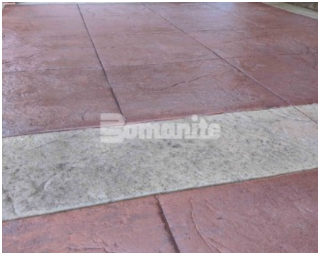
Residence Condominiums - Bomanite Imprinted Concrete System Bomacron Slate Texture with Hand Tool Joints Sidewalk