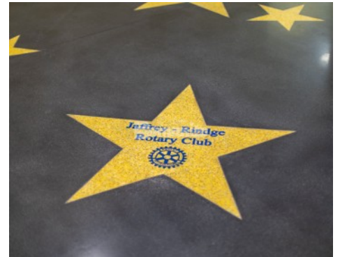
The Park Theatre - Stars - Bomanite Custom Polishing Modena TG; Flooring - Bomanite Renaissance Custom Polishing