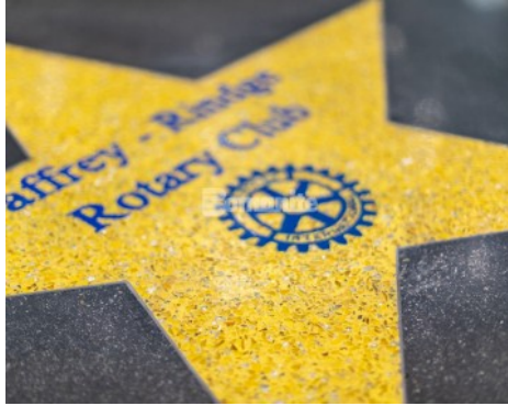
The Park Theatre - Stars - Bomanite Custom Polishing Modena TG; Flooring - Bomanite Renaissance Custom Polishing