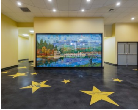
The Park Theatre - Stars - Bomanite Custom Polishing Modena TG; Flooring - Bomanite Renaissance Custom Polishing