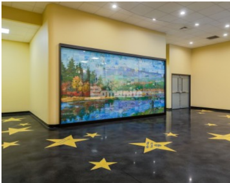
The Park Theatre - Stars - Bomanite Custom Polishing Modena TG; Flooring - Bomanite Renaissance Custom Polishing