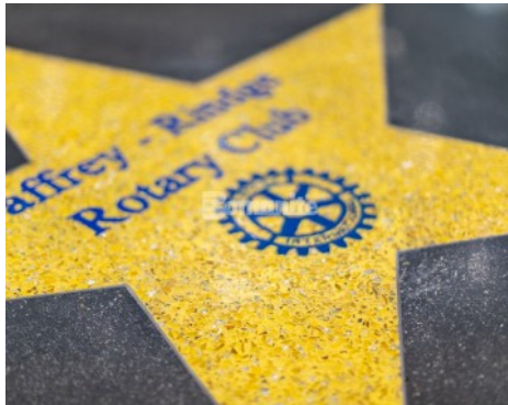
The Park Theatre - Stars - Bomanite Custom Polishing Modena TG; Flooring - Bomanite Renaissance Custom Polishing