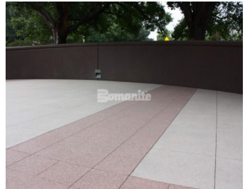
The Citadel Office Building - Bomanite Micro-Top ST wall application and Bomanite SandScape Texture Courtyard