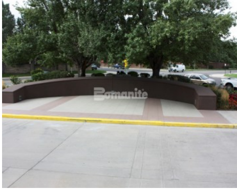
The Citadel Office Building - Bomanite Micro-Top ST wall application and Bomanite SandScape Texture Courtyard