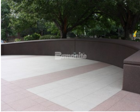
The Citadel Office Building - Bomanite Micro-Top ST wall application and Bomanite SandScape Texture Courtyard