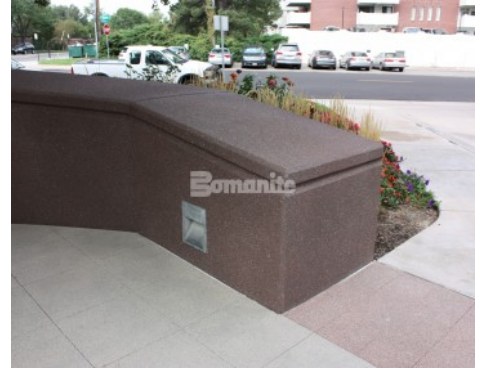
The Citadel Office Building - Bomanite Micro-Top ST wall application and Bomanite SandScape Texture Patio