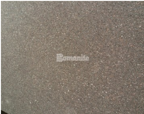
The Citadel Office Building - Bomanite Micro-Top ST wall application close up