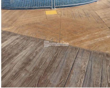
Branson Boardwalk Aquarium - Bomanite Imprint Systems Custom Hexagon Boardwalk Pattern with Custom 8' Radius Boardwalk Planks