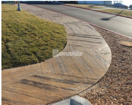
Branson Boardwalk Aquarium - Bomanite Imprint Systems Custom Hexagon Boardwalk Pattern