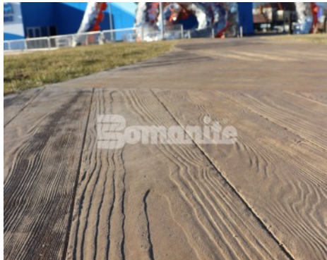
Branson Boardwalk Aquarium - Bomanite Imprint Systems Custom Hexagon Boardwalk Pattern with Custom 8' Radius Boardwalk Planks