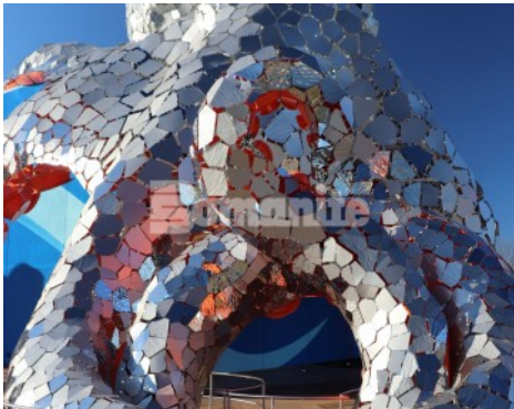
Branson Boardwalk Aquarium - Bomanite Imprint Systems Custom Hexagon Boardwalk Pattern with Custom 8' Radius Boardwalk Planks