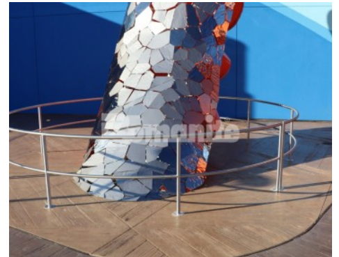
Branson Boardwalk Aquarium - Bomanite Imprint Systems Custom Hexagon Boardwalk Pattern with Custom 8' Radius Boardwalk Planks