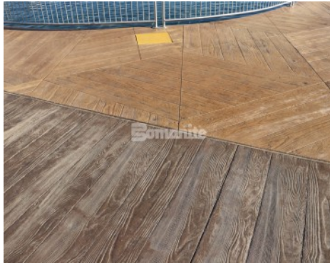
Branson Boardwalk Aquarium - Bomanite Imprint Systems Custom Hexagon Boardwalk Pattern with Custom 8' Radius Boardwalk Planks