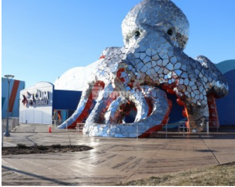
Branson Boardwalk Aquarium - Bomanite Imprint Systems Custom Hexagon Boardwalk Pattern with Custom 8' Radius Boardwalk Planks