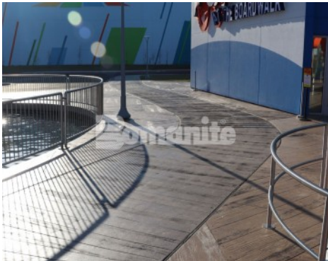
Branson Boardwalk Aquarium - Bomanite Imprint Systems Custom Hexagon Boardwalk Pattern with Custom 8' Radius Boardwalk Planks