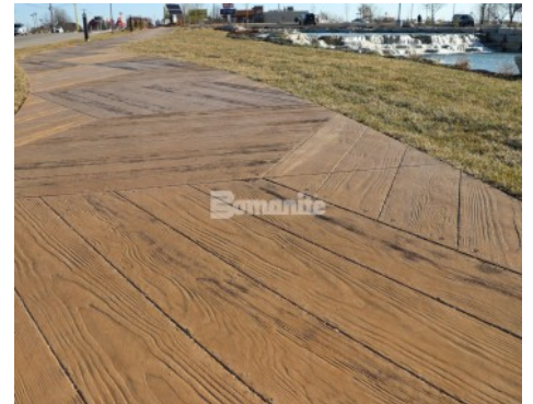
Branson Boardwalk Aquarium - Bomanite Imprint Systems Custom Hexagon Boardwalk Pattern