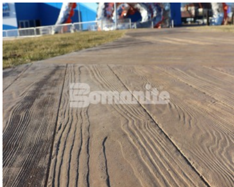
Branson Boardwalk Aquarium - Bomanite Imprint Systems Custom Hexagon Boardwalk Pattern with Custom 8' Radius Boardwalk Planks