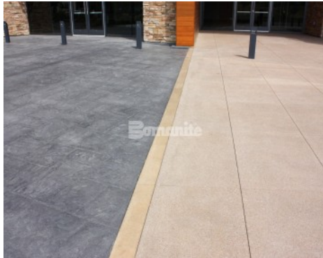
Charles Schwab Retail and Conference Center Lone Tree Campus - Bomanite Sandstone Texture with Saw Cuts and Bomacron English Sidewalk Slate Stamped Concrete Pattern