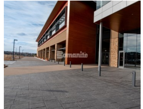
Charles Schwab Retail and Conference Center Lone Tree Campus - Bomanite Sandstone Texture with Saw Cuts and Bomacron English Sidewalk Slate Stamped Concrete Pattern