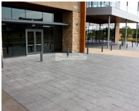
Charles Schwab Retail and Conference Center Lone Tree Campus - Bomanite Sandstone Texture with Saw Cuts and Bomacron English Sidewalk Slate Stamped Concrete Pattern