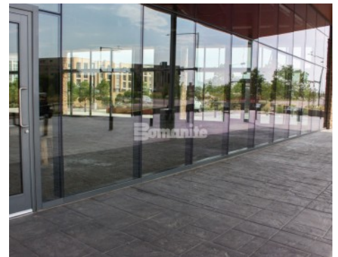
Charles Schwab Retail and Conference Center Lone Tree Campus - Bomacron English Sidewalk Slate Stamped Concrete Pattern