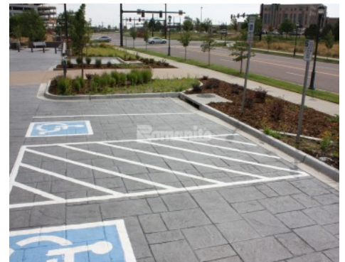
Charles Schwab Retail and Conference Center Lone Tree Campus - Bomacron English Sidewalk Slate Stamped Concrete Pattern