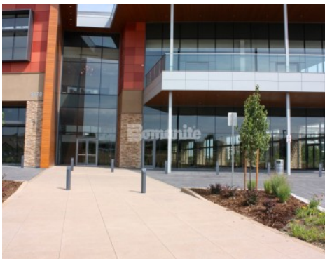
Charles Schwab Retail and Conference Center Lone Tree Campus - Bomanite Sandstone Texture Walkway with Saw Cuts