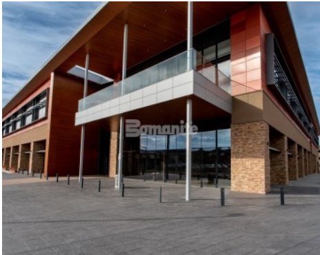
Charles Schwab Retail and Conference Center Lone Tree Campus - Bomanite Sandstone Texture with Saw Cuts and Bomacron English Sidewalk Slate Stamped Concrete Pattern