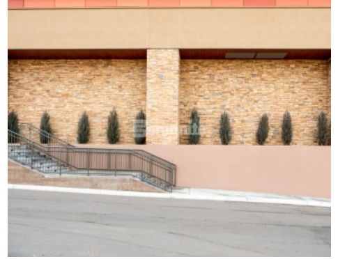
Charles Schwab Retail and Conference Center Lone Tree Campus - Bomanite Toppings Systems Micro-Top ST Board Formed Walls