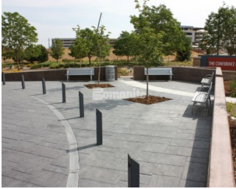
Charles Schwab Retail and Conference Center Lone Tree Campus - Bomacron English Sidewalk Slate Stamped Concrete Pattern