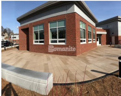
Chamberlain Elementary - Exposed - Sandscape - Connecticut Bomanite