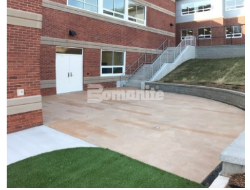
Chamberlain Elementary - Exposed - Sandscape - Connecticut Bomanite