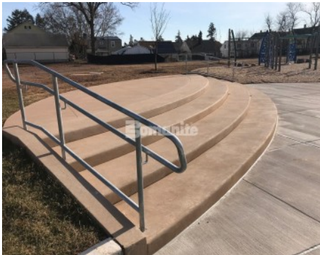
Chamberlain Elementary - Exposed - Sandscape - Connecticut Bomanite