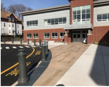
Chamberlain Elementary - Exposed - Sandscape - Connecticut Bomanite