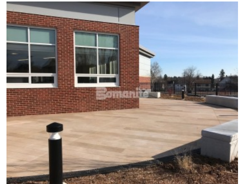
Chamberlain Elementary - Exposed - Sandscape - Connecticut Bomanite