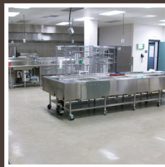
Premier Concrete Construction